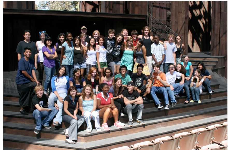
Cast and Crew

Friar Laurence arrives at the tomb to find Romeo and Paris dead, Paris by Romeo's hand and Romeo by the fatal poison. When Juliet revives, the Friar, frightened at the watch's approach, attempts to draw her from the tomb, but fails and leaves alone, for Juliet will not move from her love's side; instead, she stabs herself with a dagger as the watch enters. Summoned by Paris' servant, the watch finds the dead bodies, and then proceeds to call forth the Princess as well as the Capulet and Montague families. The Friar reveals the story of the young lovers which propels Capulet and Montague to end their senseless feud.